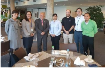
With ILO team concerned with Ali Garments Baldia Karachi compensation to victims families