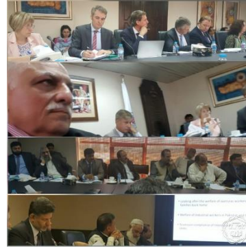
EU GSP Plus Monitoring Mission meeting with tripartite stakeholders at Overseas Pakistanis Foundation Head Office in Islamabad.