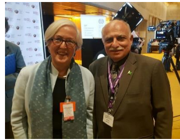
School, at ICLS20.