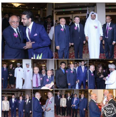
With Sindh Minister Taimur Talpur, Consul Generals and friends at Thailand Consulate General reception to celebrate National Day, Anniversary of the