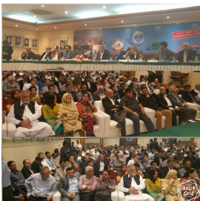
Abdul Razak Dawood, Advisor to Prime Minister for Commerce, Textile, Investment, Industries and Production at Karachi Chamber of Commerce and Industry