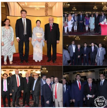
Japanese Consulate General reception to celebrate the Birthday of His Majesty the Emperor