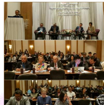
Opening ceremony of CAPE-ITUC-AP Regional Dialogue on Future of Work towards Sustainable and Inclusive Asia and the Pacific in Bangkok'