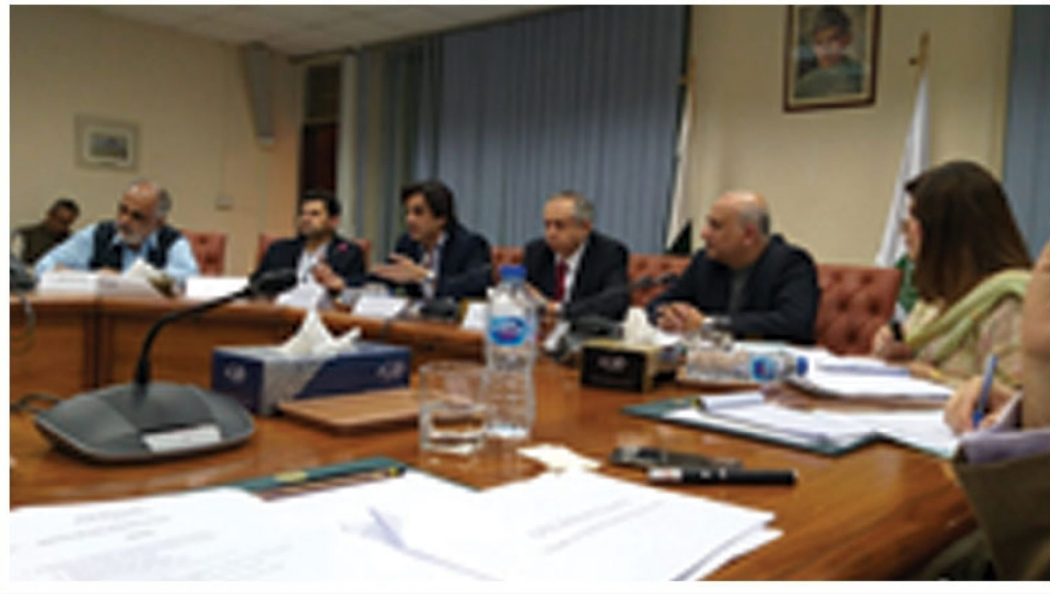
Abdul Razak Dawood chairing meeting of CPEC Advisory Council at BOI Islamabad